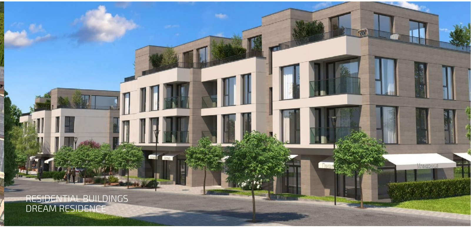
RESIDENTIAL BUILDINGS DREAM RESIDENCE