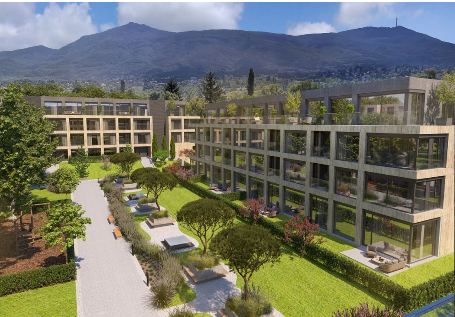
GATED COMMUNITY RESIDENTIAL COMPLEX GREEN DISTRICT PARK