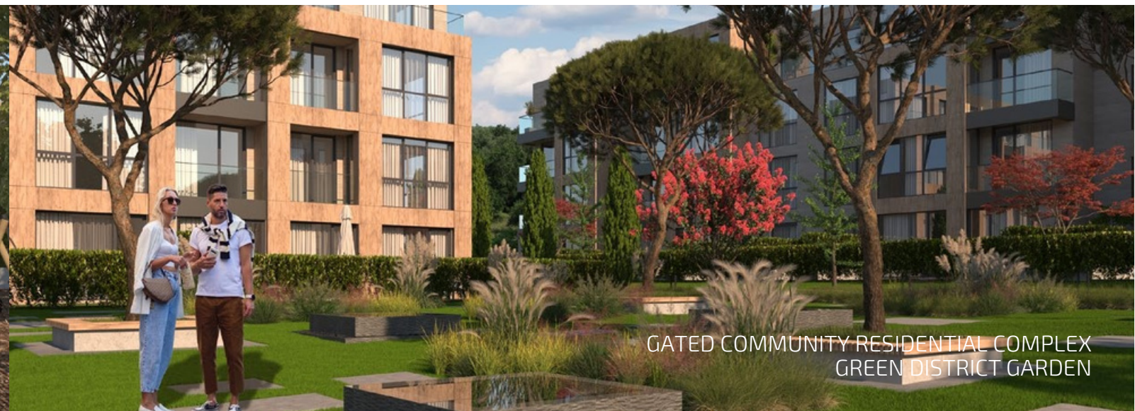
GATED COMMUNITY RESIDENTIAL COMPLEX GREEN DISTRICT GARDEN